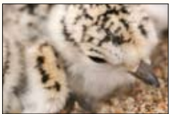
Snowy Plover chicks. (See page 4). Jenny Erbes