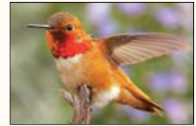
Rufous Hummingbird. (See "The Power of Information," page 2.)