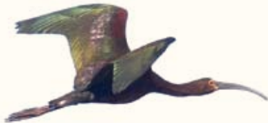
White-faced Ibis—one of the many species using Central Valley habitats.

Partnering for Bird Conservation. With The Nature Conservancy of California and Audubon California, we are building the Migratory Bird Conservation Partnership. Working with the California Rice Commission, we identified and tested multiple management practices for Central Valley rice growers to benefit wetland-dependent birds. In the San Joaquin and Klamath basins, we advanced efforts to ensure that river restoration for fish populations will also benefit migratory birds. http://camigratorybirds.org/