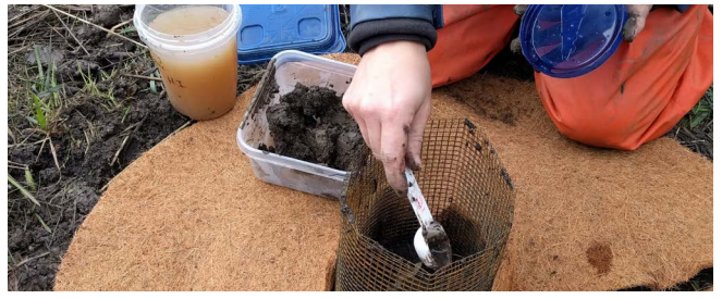
Point Blue field scientist adding inoculum to the soil during planting.