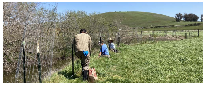
Work in the field at a riparian restoration site.