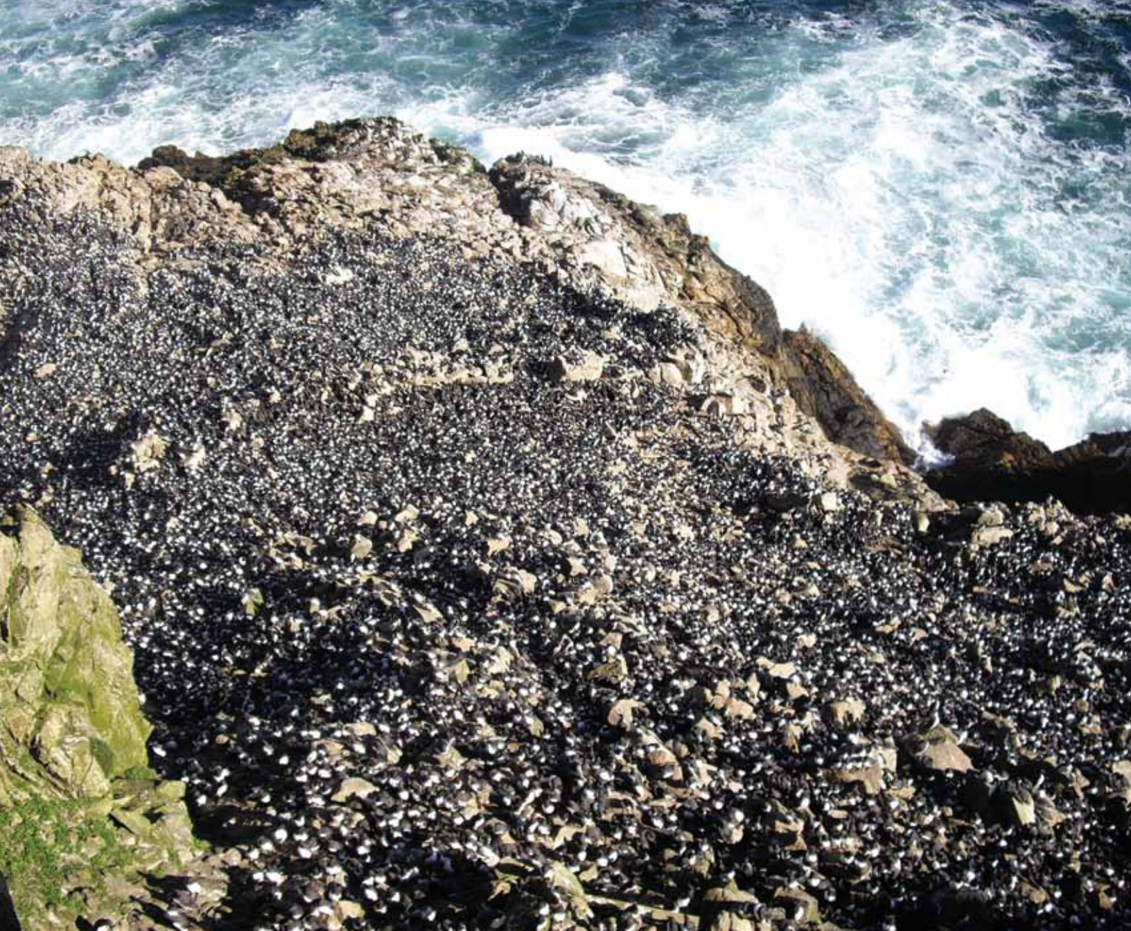
Above: View from the murre blind during peak seabird breeding season on Southeast Farallon Island.

colony. As I watched and marveled at these thousands of birds, now incubating large, beautifully patterned eggs, I felt lucky to be a part of this research. On the first day atop Shubrick Point, I had been in awe of the murres but now could feel an even greater sense of appreciation. Through studying them, I had come to understand a part of their lives.