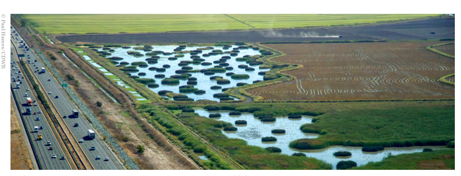
Yolo Causeway crossing Yolo Bypass and Vic Fazio Yolo Wildlife Area along Interstate 80, California.