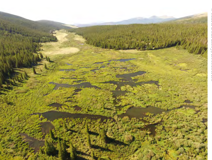
An aerial view of Sheep Creek in Pike-San Isabel National Forest, Colorado.

Riverine wetlands also can store the same amount of aboveground carbon as mangroves and should be prioritized for protection and recovery.22