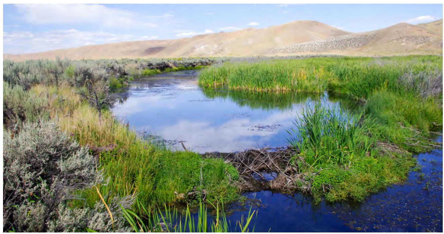
Maggie Creek, Nevada, after cattle grazing agreements and the reintroduction of beavers.