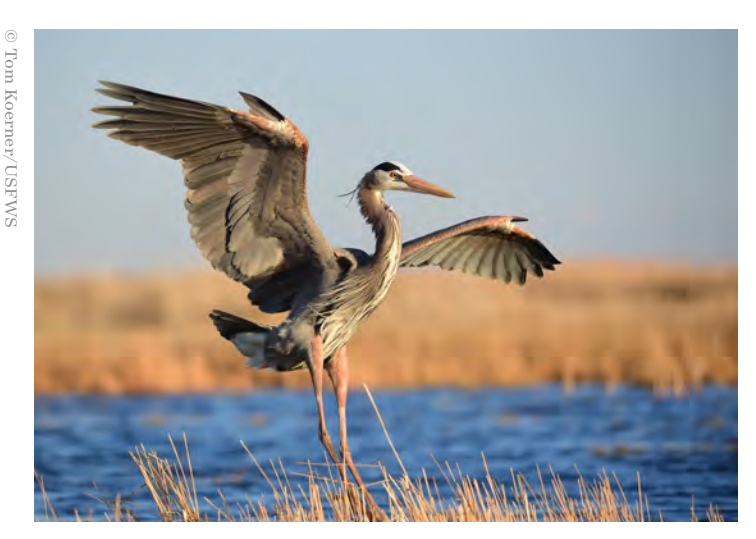
A great blue heron at Seedskadee National Wildlife Refuge, Wyoming.

With NRDC support, Point Blue Conservation Science reviewed 160 studies on various wetland benefits in North America and found significant evidence for many overlapping benefits. Conserving and restoring these valuable habitats