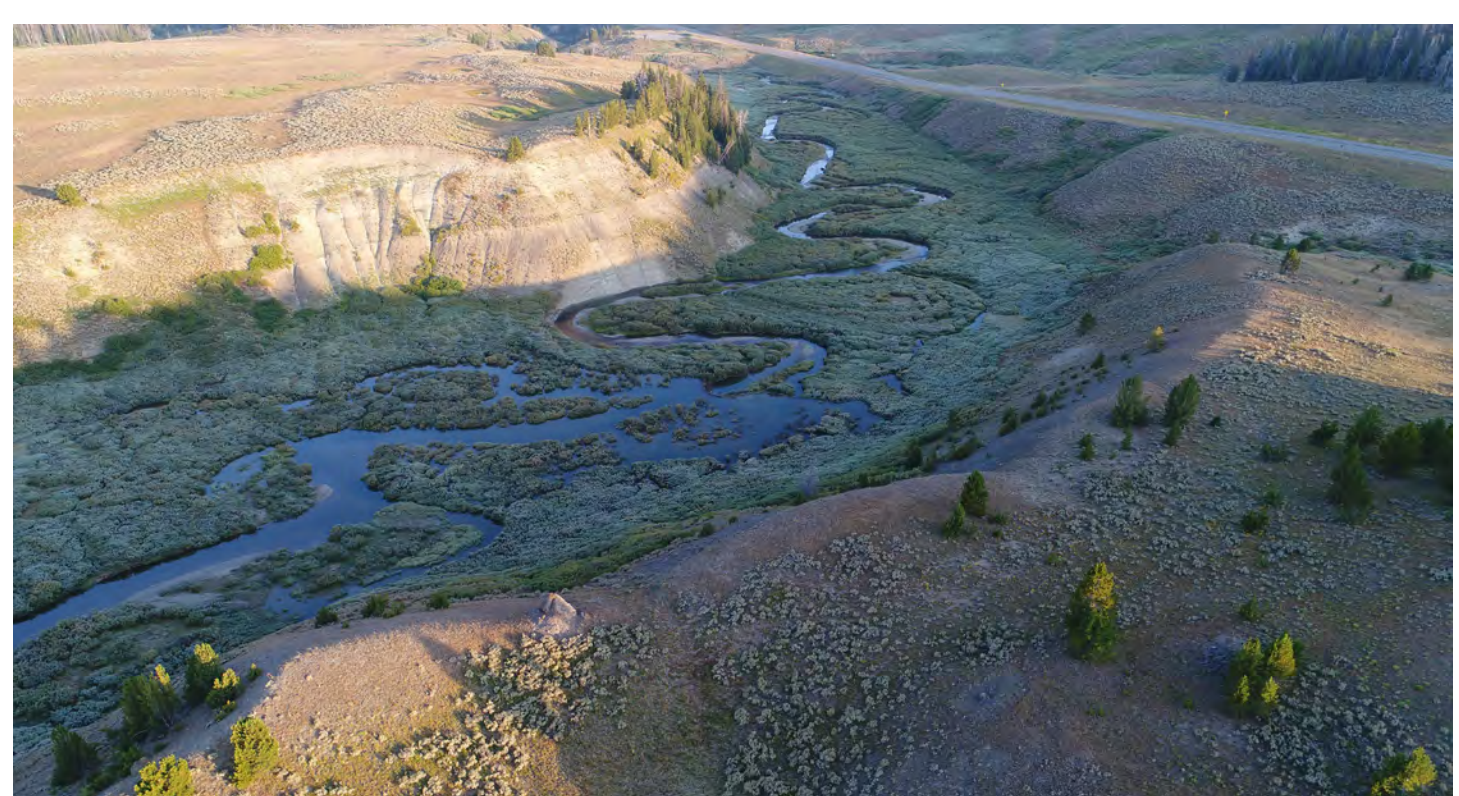
An aerial view of a healthy riverscape on Blackrock Creek in Bridger-Teton National Forest, Wyoming.

The success of beaver dam analogs at Bridge Creek demonstrates the effectiveness of a low-tech, process-based restoration tool to restore rivers and floodplain functions across degraded riverscapes. Once reestablished, these naturalized systems can support resilient beaver colonies, reconnect incised channels with floodplain wetlands, nurture riparian vegetation, and benefit aquatic species, including salmonids.<sup>32</sup>