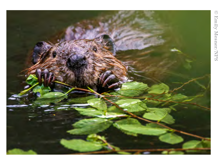
A beaver in Denali National Park and Preserve, Alaska.

design these projects in compliance with funding requirements,