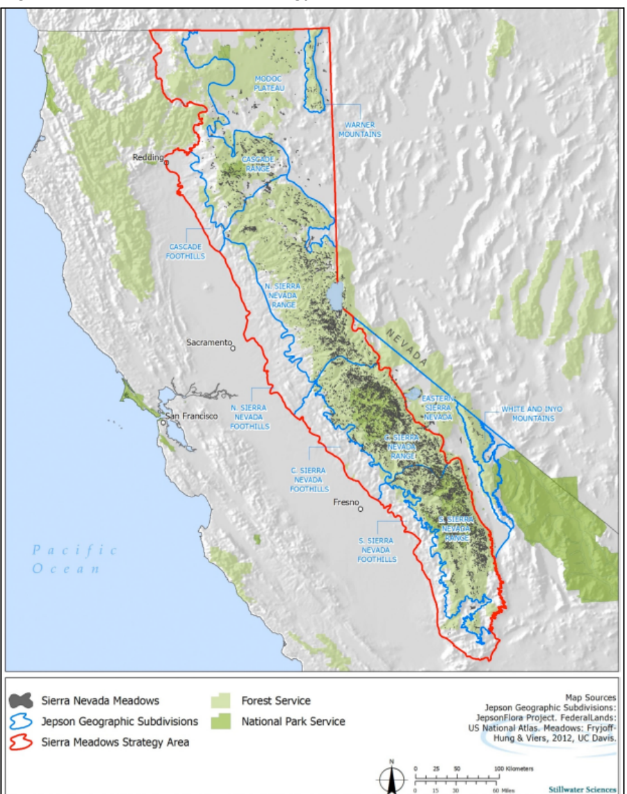
Figure 1. Sierra Meadows Strategy area.

Projects must be located within the boundaries of the Sierra Meadows Strategy geography (Figure 1).